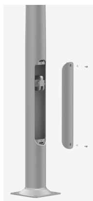
2. Unscrewing the hinge's bolt