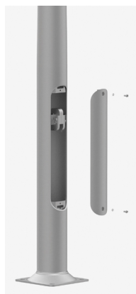
2. Unscrewing the hinge's bolt