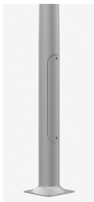
1. Removing the door