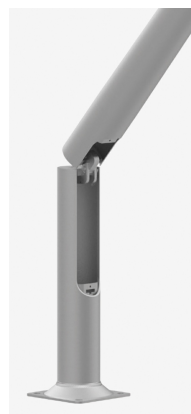
3. Manually lowering the column