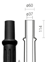
Spigot type „A” – Ø60

For mounting bracket configuration: type "P",