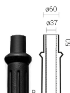
Spigot type „B” – Ø60

For mounting extension arms: WT, WA-1,WA-01, WA-4